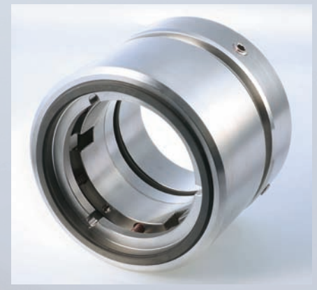
A typical HJ seal with shrunk-in sliding face

Three flights from Frankfurt-Hahn Airport in Germany were needed to transport the pumps, engines, etc. to Khartoum. The Chinese customer took possession of the systems in Khartoum and transported them by heavy vehicle to the final destinations. Teams sent out by the pump manufacturers kept an eye on the installation work and provided on-site training. The pumps have now been in operation for five years. There is currently no other comparable screw pump installation anywhere in the world. Despite the adverse conditions, there have been no problems on the project. Seals and pumps mastered the difficult startup conditions and showed an outstanding sealing performance.