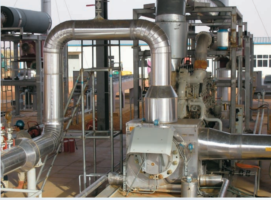
Bornemann high pressure crude oil pump in operation

Six pumping stations keep the crude oil flowing smoothly through the pipeline. High pressure twin screw pumps were commissioned at Pump Station I beginning 2004 and subsequently Petro-Energy decided to install similar pumps at stations III and IV. The following equipment is needed at each pump station: